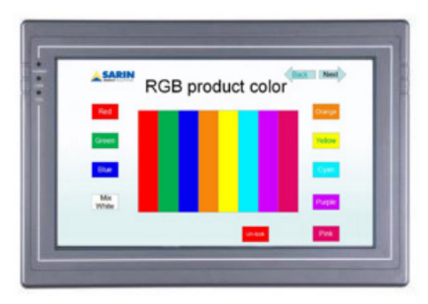
P2 Programming System