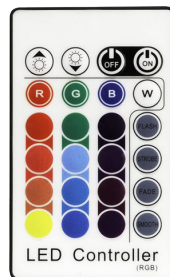
Remote Version Pictured